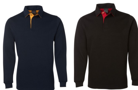
Rugby Top $55