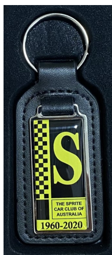
60th Keyrings $5