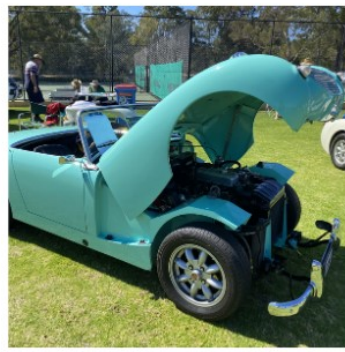
3RD BUGEYE S.ALLEN