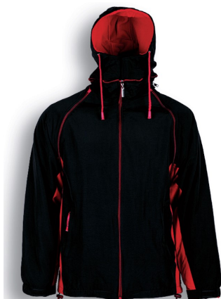
3-in-1 Jacket $75