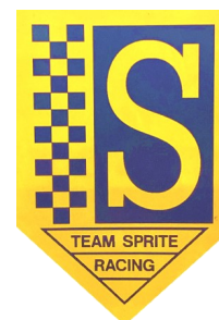
Team Sprite Racing logo