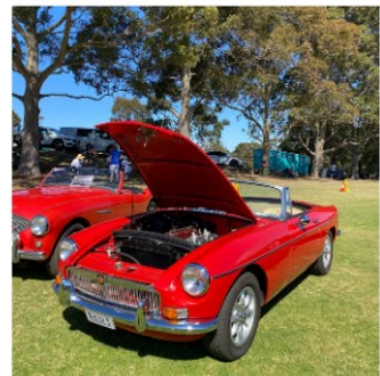
BEST PAINT MAX SQUIRES