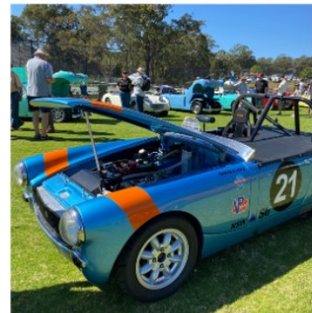
2ND SPRITE/MIDGET DERIVATIVE W.HOTZ