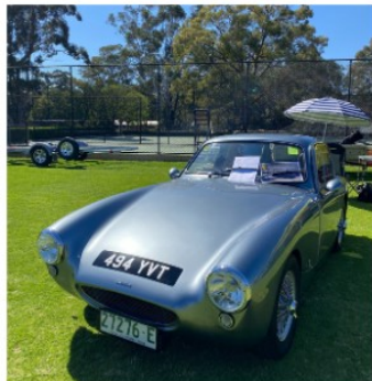
1ST SPRITE/MIDGET DERIVATIVE P.MEYER