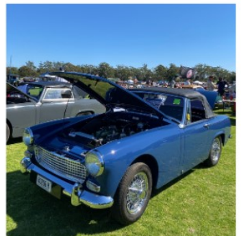
BEST IN SHOW STEVE RIVETT