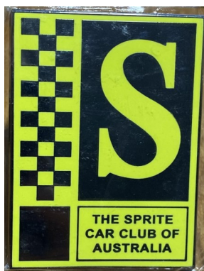
Grille Badge $40