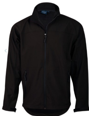
Softshell Jacket $60