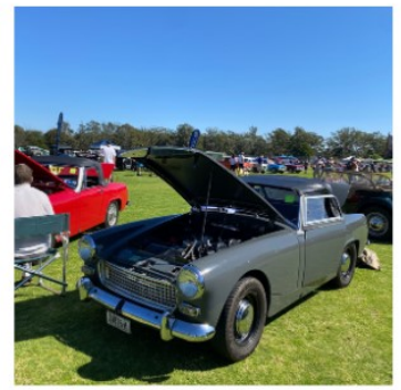
1ST SPRITE MK2/A & MIDGET MK1 G.WELLS