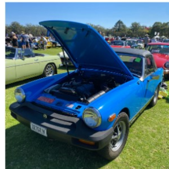
1ST MIDGET 1500 G.PRUNSTER