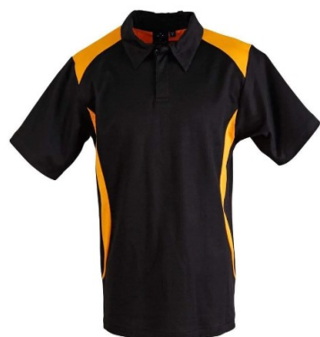
Polo shirt $35